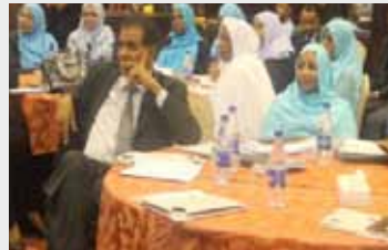
Banking Workshop participants (Sudan)

Two workshops were held in Khartoum, Sudan. A workshop for the banking sector, which was hosted by the Central Bank of Sudan from 18 – 20 February 2014, saw attendance of 65 participants.