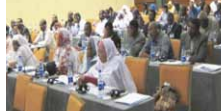
Participants in the 6 th IFSB on the Regulation of Takāful