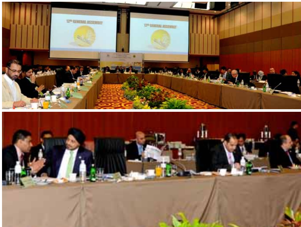
Participants attending the General Assembly

The General Assembly was held on 27 March 2014 in Bandar Seri Begawan, Brunei Darussalam.