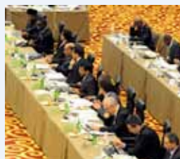
Participants attended the 9 th Islamic Financial Stability Forum