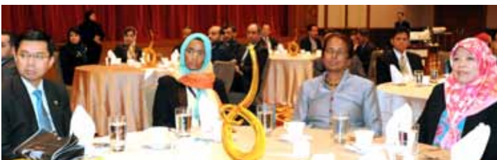
Among the delegates attending the Meet the Members Session in Brunei