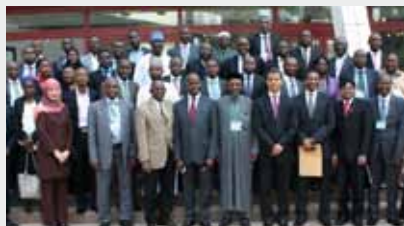
Banking Workshop participants (Nigeria)

The IFSB has conducted three series of workshops in January and February 2014. The first workshop was held in Abuja, Nigeria from 13 -17 January 2014, hosted by the Central Bank of Nigeria. The Workshops were designed specifically for the banking sector and attended by 53 participants from the central bank, securities commission and insurance supervisory authority.