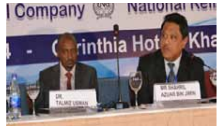
The IFSB Special Session in the GTG/ICMIF/IFTI Joint Network Takāful Seminar