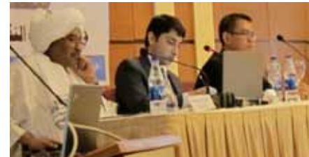
Chairperson and speakers of Session 1 of the 6 th IFSB Seminar on the Regulation of Takāful

It was attended by almost 150 participants from government, regulatory and supervisory bodies, and key players of the global Takāful industry.