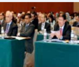
Speakers and participants attended the 6 th IFSB Legal Seminar