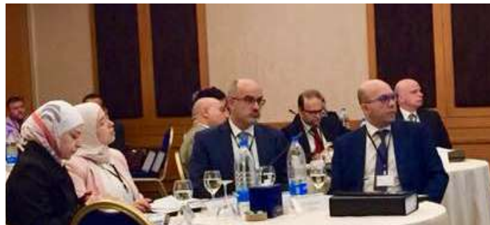
FIS Workshop in Lebanon