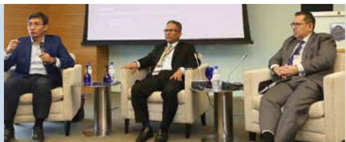
Panel Discussion on Regulatory Regime for Fund Management and Pension Schemes: Avoiding a Social Economic Disorder