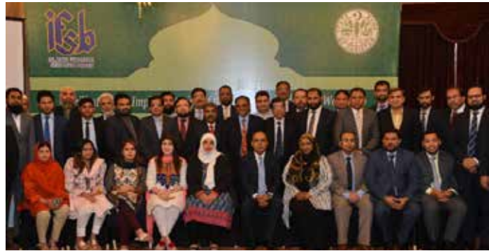
FIS Workshop in Pakistan

For more information on future Workshops, kindly visit the IFSB website at www.ifsb.org