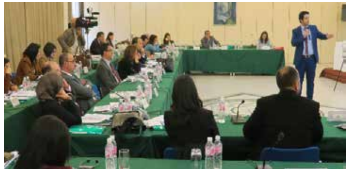
FIS Workshop in Tunisia